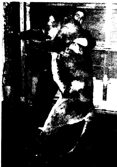
Photo of a cougar killed in Steeleville, Mo. The guy who shot it is 6 foot tall and weights about 220 lbs. He was in a deer stand and

saw the cat pass him downwind. He then saw it pass upwind. When the cat passed him again; closer this time; downwind. He knew that it was hunting him. So, BOOM!!! We do have these things in this part of the Country. Steeleville Mo. is about 80 miles SW of St. Louis. Lots of people live in the area.